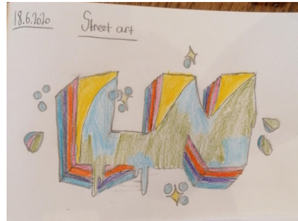
Lola's Street Art work.