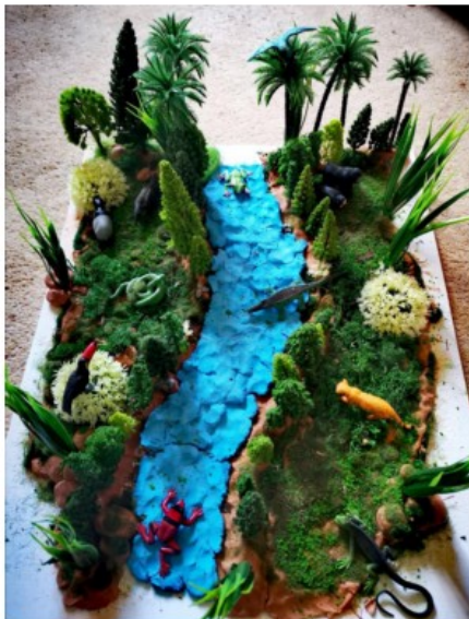
Tim's beautiful Rainforest model