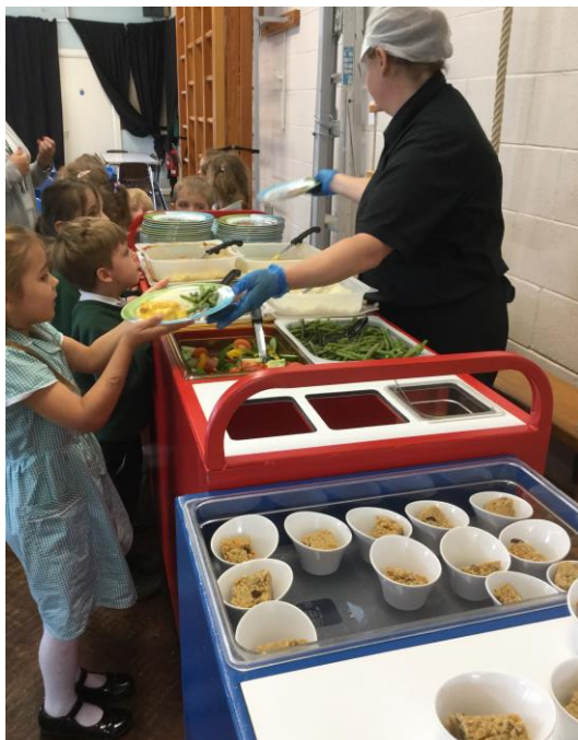
Collecting our lunch