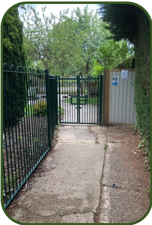
Come into school via this gate