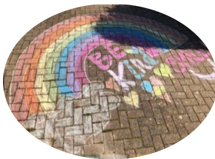
Phoebe and Isobel's chalk rainbow